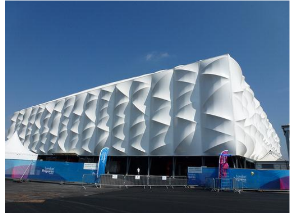
Olympic Basketball Arena

The Preliminary Round games and Quarter-Finals of the Women's Basketball Tournament will be played in the Olympic Basketball Arena with the Semi-Finals and Finals then played in the North Greenwich Arena.